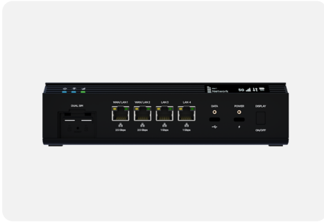
Inseego Wavemaker™ 5G Cellular Router FX4200