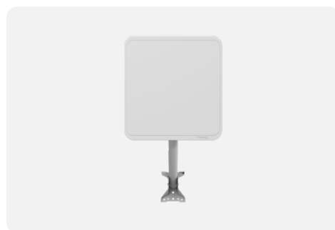
Inseego Wavemaker 5G outdoor CPE FW2000