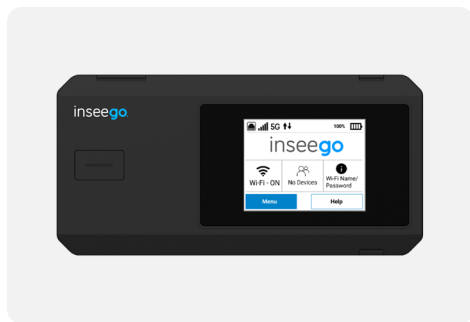
MiFi® PRO M4 5G Mobile Router