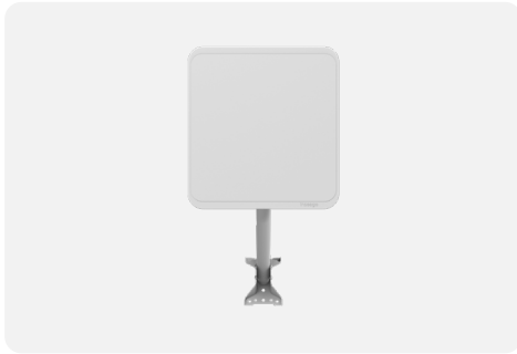
Inseego Wavemaker 5G outdoor CPE FW2000