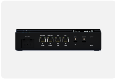
Inseego Wavemaker 5G Cellular Router FX4200