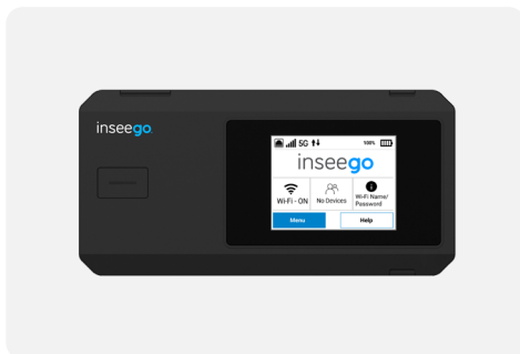
MiFi® PRO M4 5G Mobile Router